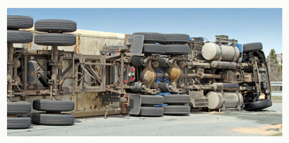
* National Highway Traffic Safety Administration. <a href="https://crashstats.nhtsa.dot.gov/Api/Public/ViewPublication/813452.pdf">https://crashstats.nhtsa.dot.gov/Api/Public/ViewPublication/813452.pdf</a>

Per the National Highway Traffic Safety Administration* (NHTSA), 5,788 people were killed and an estimated 154,993 people were injured in traffic crashes trucks in involving large TruckInfo.net estimates that, of the hundreds of thousands of truck accidents that happen every year: 71 percent of injuries are from occupants in other motor vehicles, 27 percent are from the occupants of the large truck, and around 2 percent are other individuals like pedestrians bicyclists. TruckInfo.net* also estimates that 116,353 large trucks were involved in accidents in 2022. 1,591 of those accidents happened in Mississippi.